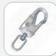
Swivel Snap Hook; 3/4" (19.1 mm) Gate Opening