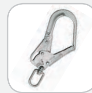
Swivel Rebar Hook 2-1/2" (63.5 mm) Gate Opening