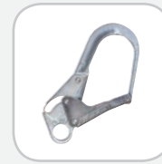
Rebar Hook; 2-1/2" (63.5 mm) Gate Opening