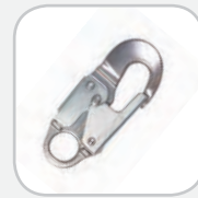
Aluminum Snap Hook; 3/4" (19.1 mm) Gate Opening