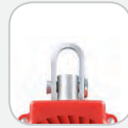
Without Unit Connector