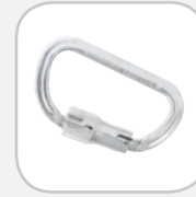
Aluminum Carabiner; 3/4" (19.1 mm) Gate Opening