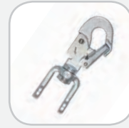
D-Ring Swivel Hook 3/8" (9.5 mm) Gate