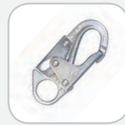
Snap Hook; 3/4" (19.1 mm) Gate Opening