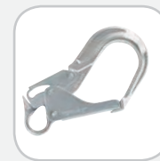
Aluminum Rebar Hook; 2-1/2" (63.5 mm) Gate Opening