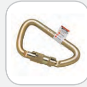
Steel Carabiner; 1" (25.4 mm) Gate Opening